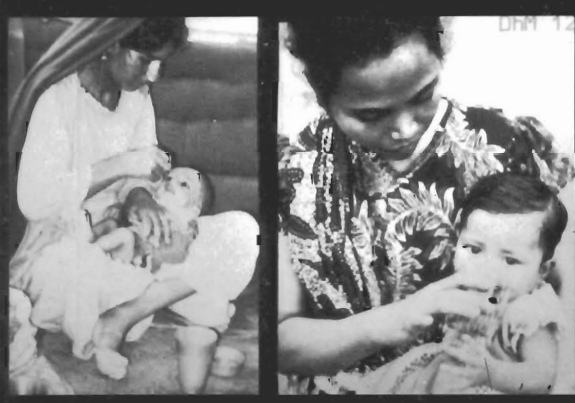
How to give oral rehydration fluids.