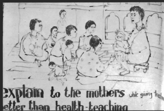
Explain about diarrhoea to mothers while you are treating their children.

BHUTAN: Examples from a locally produced slide set on treatment and prevention of diarrhoea.