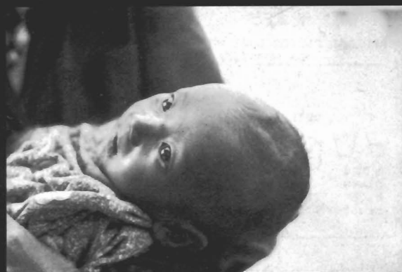
A sunken fontanelle — one of the key signs of dehydration.