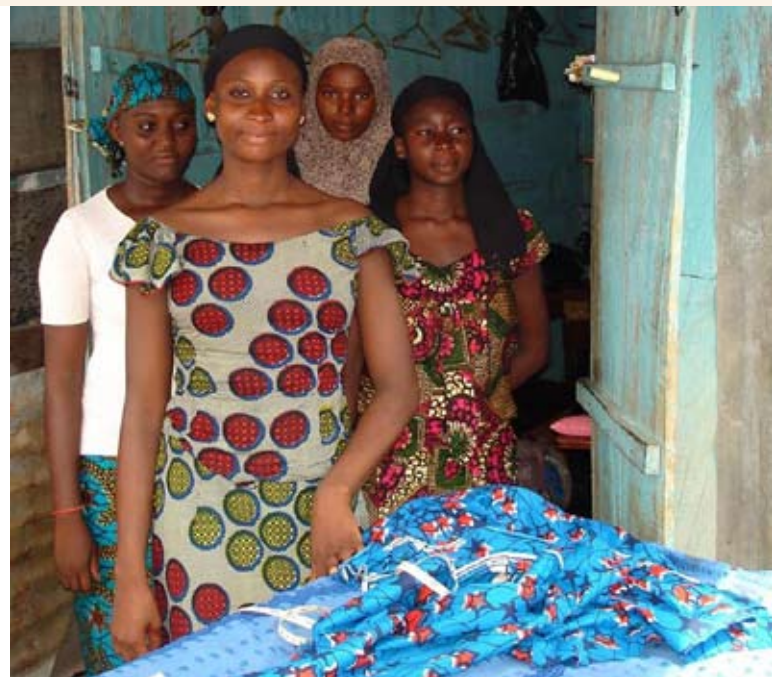
During an assessment in 2010, women in a dressmakers shop in rural Nigeria said they turn to their local radio station for information about a variety of health issues, including HIV and family planning.

Health policy helps governments define a vision for the future health of their citizens, and media that understand this can help outline national priorities, inform and educate people, and build consensus. In Nigeria, Internews helped local media target health policymakers and opinion leaders, through tools including workshops, building journalist networks, and broadcasting radio and television debates. Journalists were helped to understand the fundamentals of ethical health reporting and the social, cultural, economic and political dimensions of health in Nigeria. Internews trained and mentored more than 300 journalists from 64 media houses, to produce more than 800 stories. Through this network of journalists and media houses, Internews estimates that at least 40 million Nigerians 7 received life-changing information on HIV/AIDS, and reproductive health through local media sources.