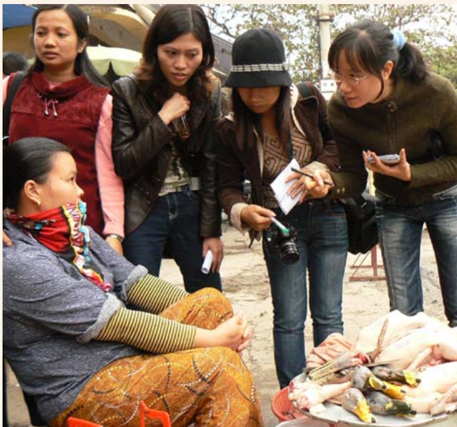
Journalists being trained by Internews on avian flu reporting interview a chicken vendor in Ha Tay province, southwest of Vietnam's capital Hanoi.