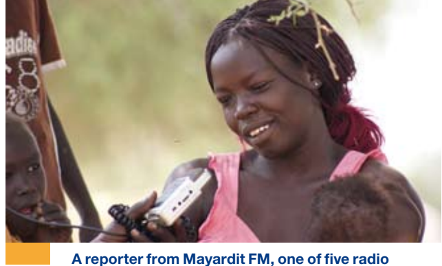
A reporter from Mayardit FM, one of five radio stations managed by Internews in Southern Sudan, interviews a woman who has fled the border region of Abyei south to Turalei.

Internews has supported the critical role of independent local media through its network of six FM radio stations. By linking the community radio stations with civil society organizations, local and international NGOs and other stakeholders, the stations produce creative, informative broadcasts, call-in shows and interactive programming on a range of development issues including health and education. Recent research 6 shows the Internews community radio network has been instrumental in