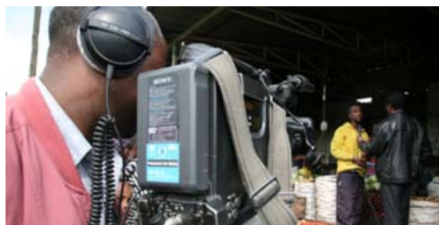
Ethiopian television crew filming during a site visit in Addis Ababa for a story about HIV and stigma.