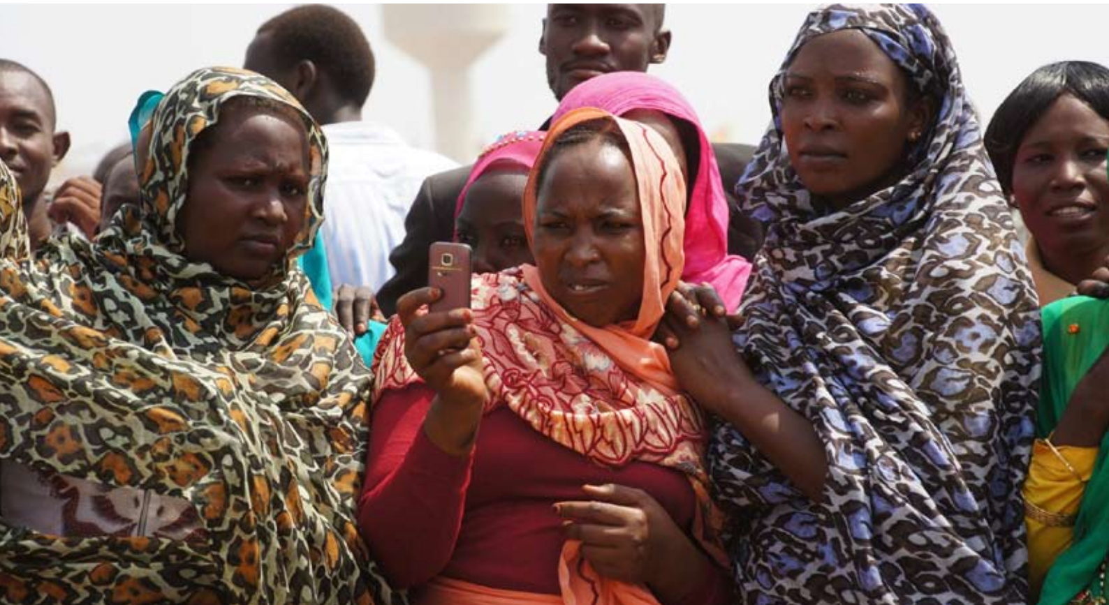
Women in South Sudan take photographs on their cell phones during the Independence Day Celebration on July 9, 2011. Even in resource poor environments, the sharing of news and information through digital technologies is rapidly expanding.